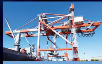
BTC Bridge Type Crane