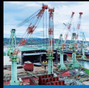
Rail Mounted Jib Crane