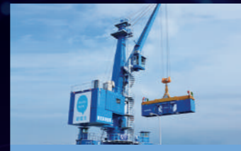
Tire Mounted Jib Crane