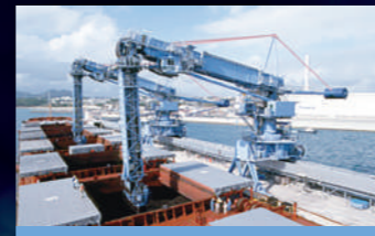
Twin Belt Unloader