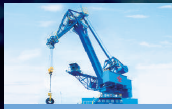
Level Luffing Crane