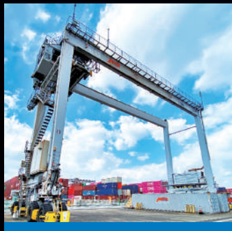
Automatic Rubber Tired Gantry Crane