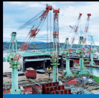
Rail Mounted Jib Crane