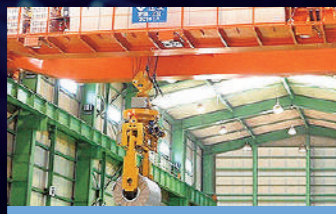
Automatic Overhead Crane