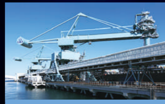
Continuous Ship Unloader