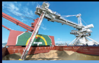
Vertical Screw Conveyor Unloader