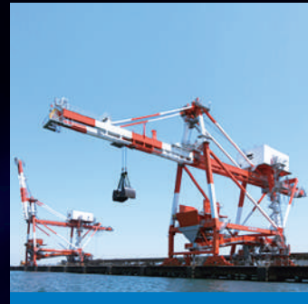
BTC UN-LOADER Bridge Type Crane